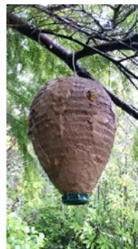
Two very creative cache containers

Although a great many caches are in parking lots and such, there are many that feature scenery, art pieces and historical sites.